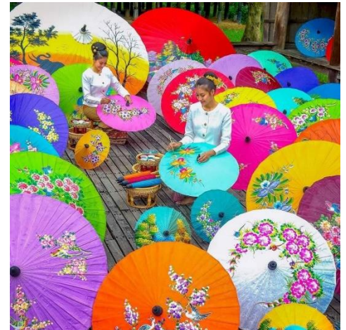
Bor Sang - the umbrella village