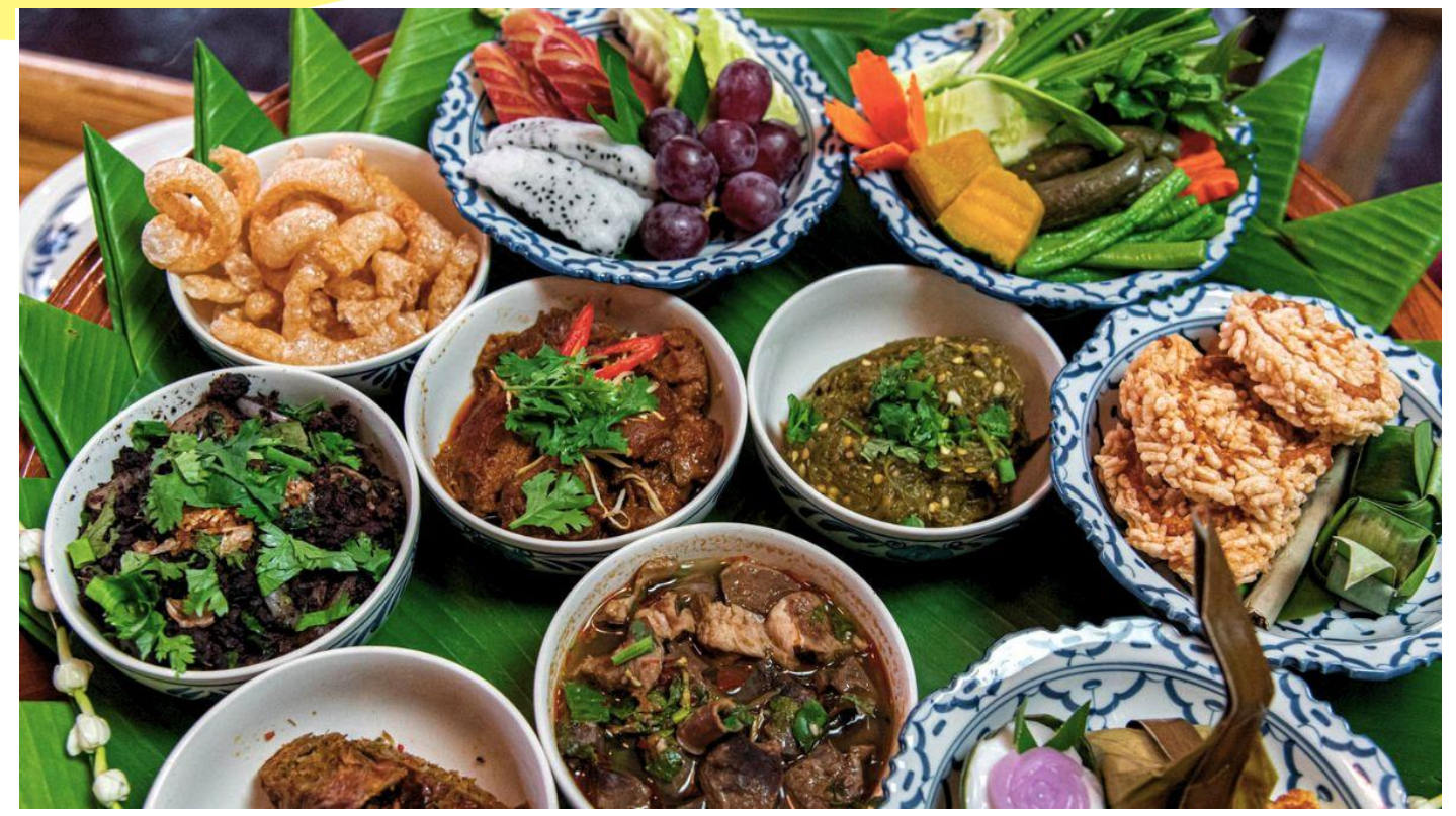
Enjoy The Khantoke Dinner In Chiang Mai

Meals: Breakfast, Dinner Accommodation: Hotel in Chiang Mai Day 10: Mae Taeng Elephant Camp