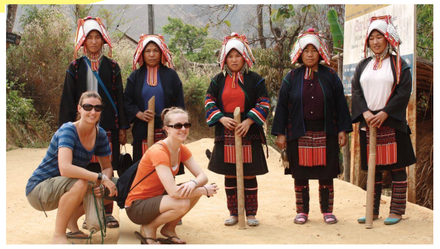
Explore The Unique Daily Life Of The Villagers