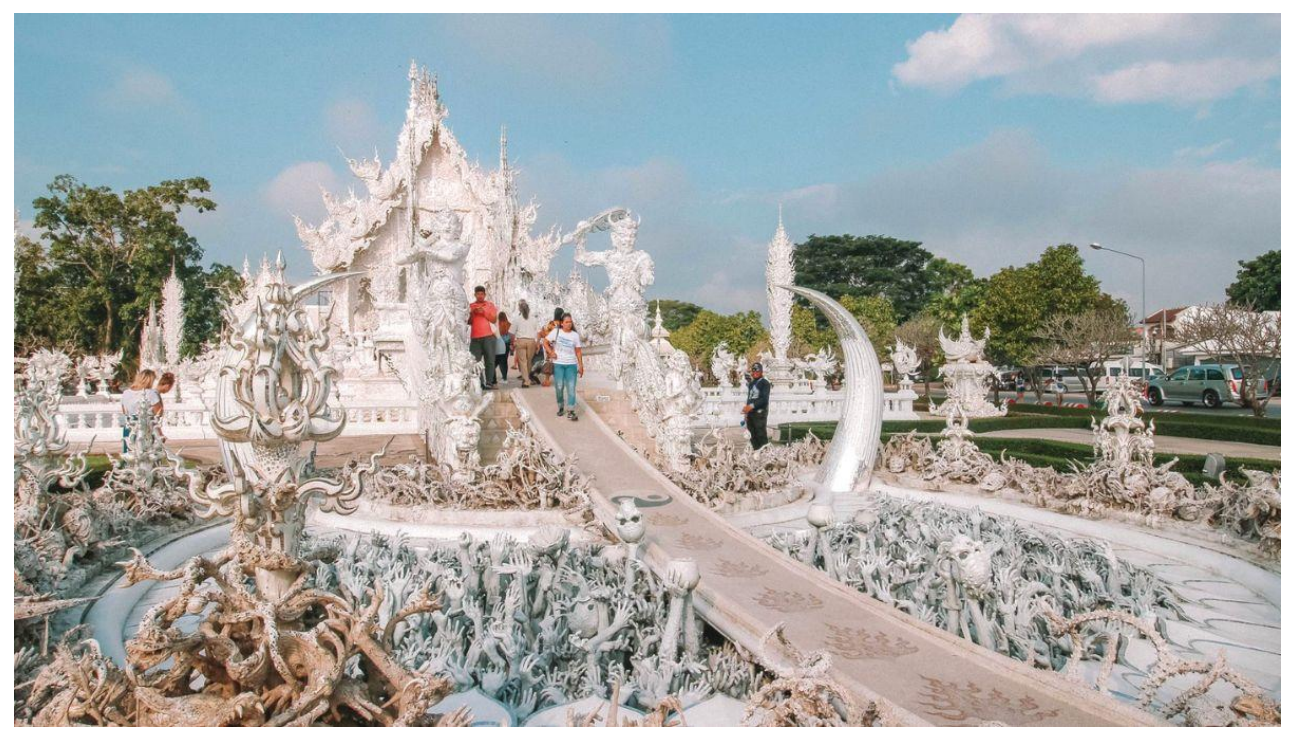
Visit The White Temple With Its Recognizable, Elaborate Embellishments And Unique Style

glass pieces that shimmer in the sun, representing the purity and wisdom of the Buddha. Start to check in at the hotel and have time to relax at leisure for the rest of the day.