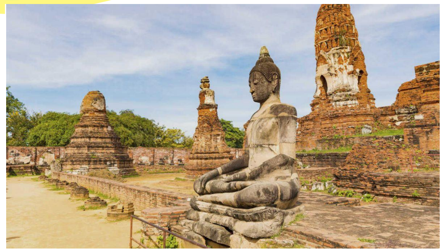
Wat Mahathat, The Oldest And Most Important Temple In Ayutthaya's History