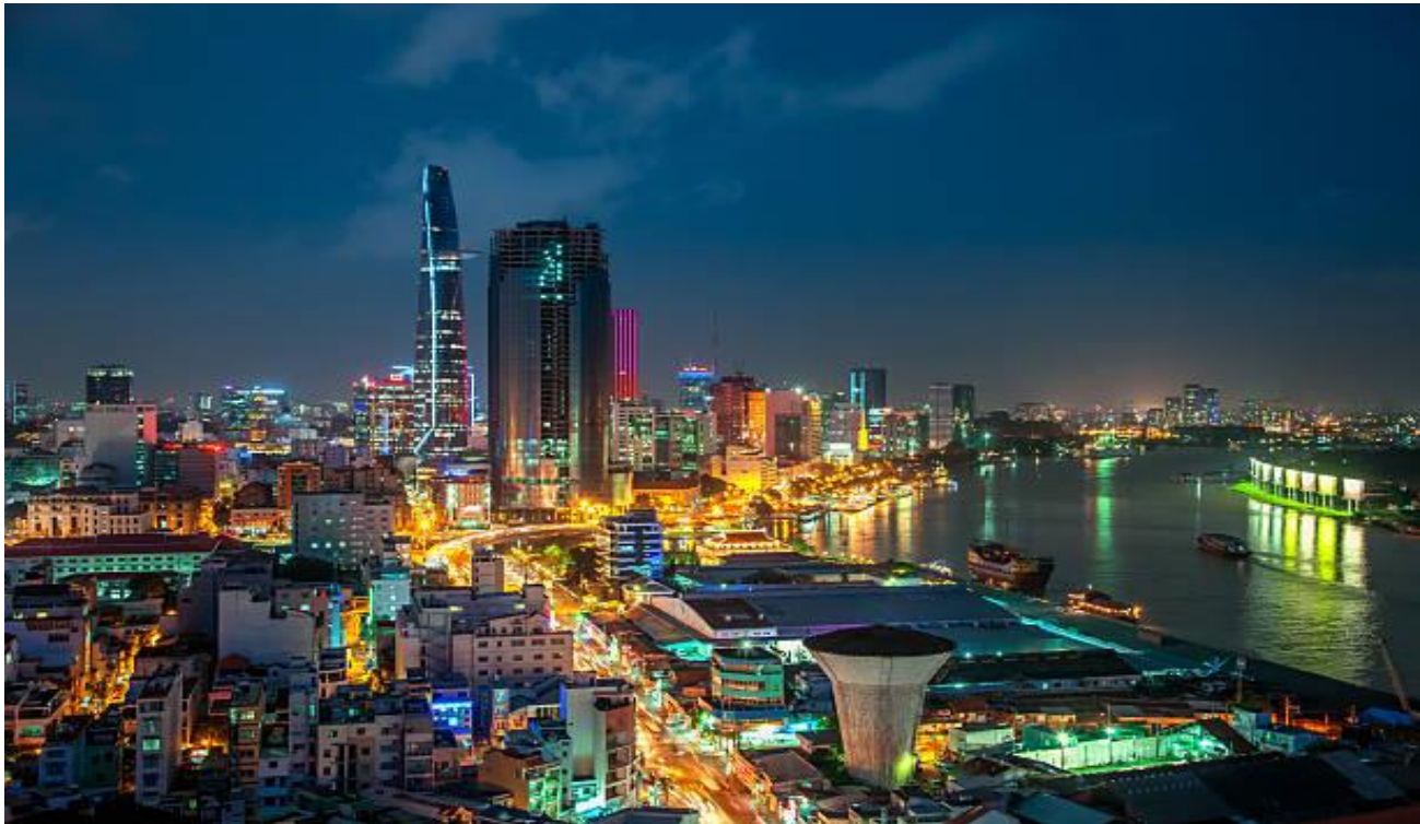
Ho Chi Minh by Night