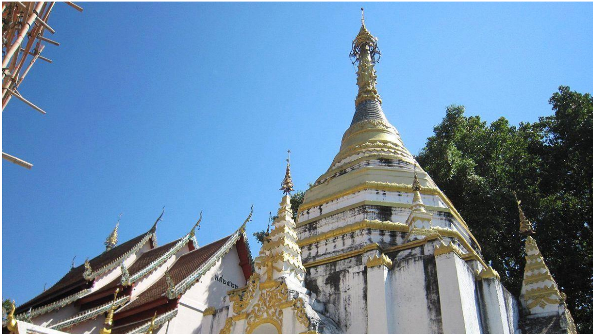
Wat Puak Tam, A Famous Temple With Brass Ornaments

Arrive at the temple and conquer 300 steps or swap two feet for a cable car to walk up to the top to explore the central chedi adorned in golden flakes, renowned for its glittering facade under the mid-day sun.