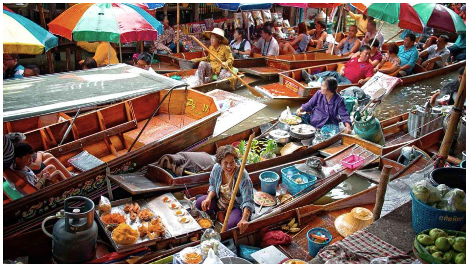
Visit The Bustling Damnoen Saduak Floating Market