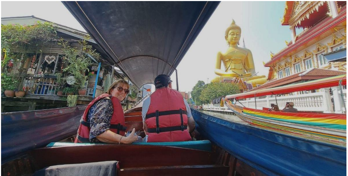
Meader Around The River For Sightseeings