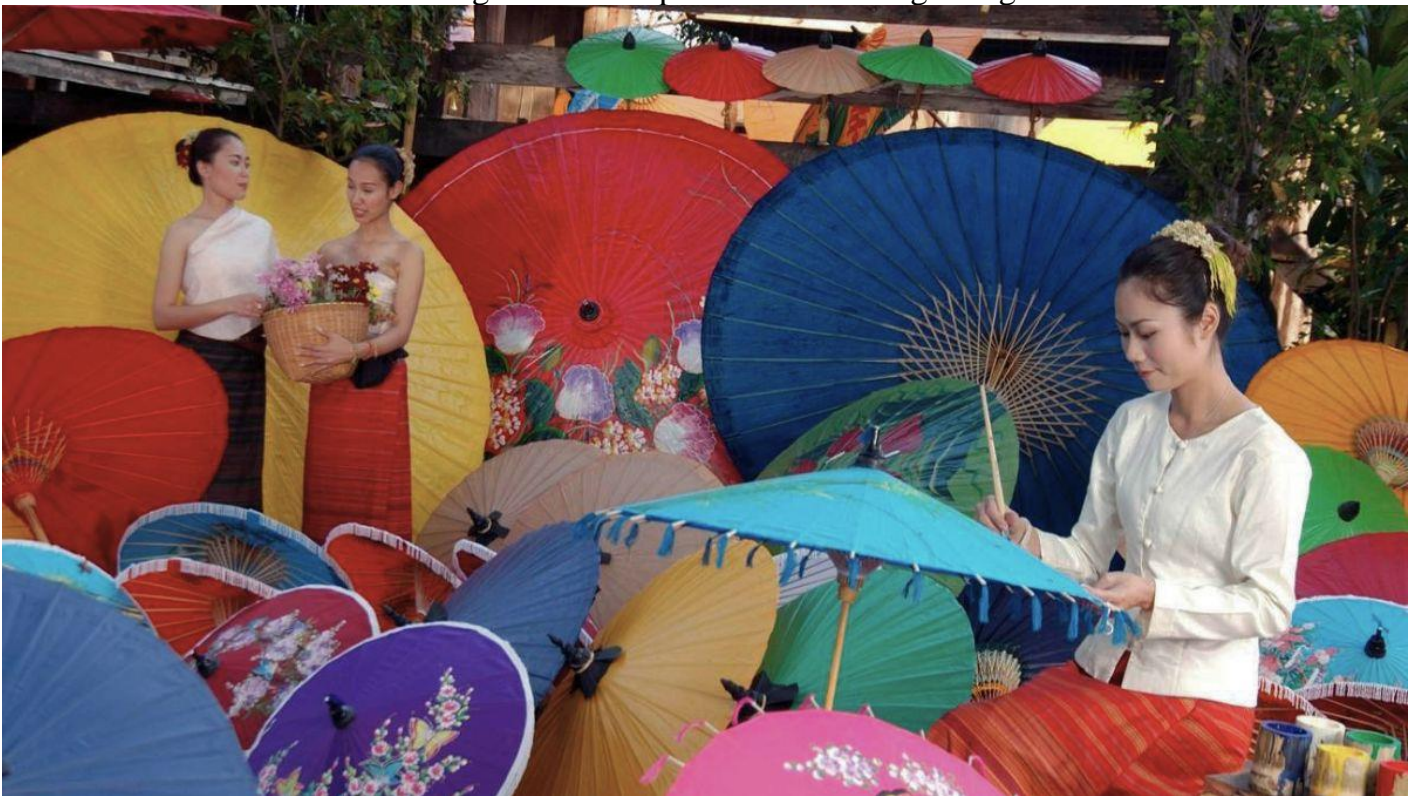
Sankampaeng District, Chiang Mai's Famous Products Are Made