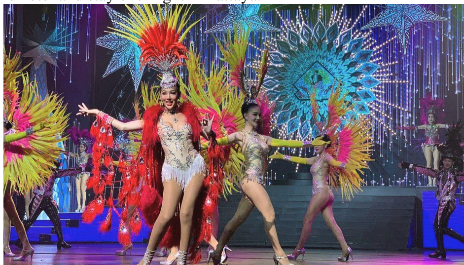
Experience The Original Transvestite Cabaret Show In Pattaya

Return back to the hotel and stay overnight in Pattaya.