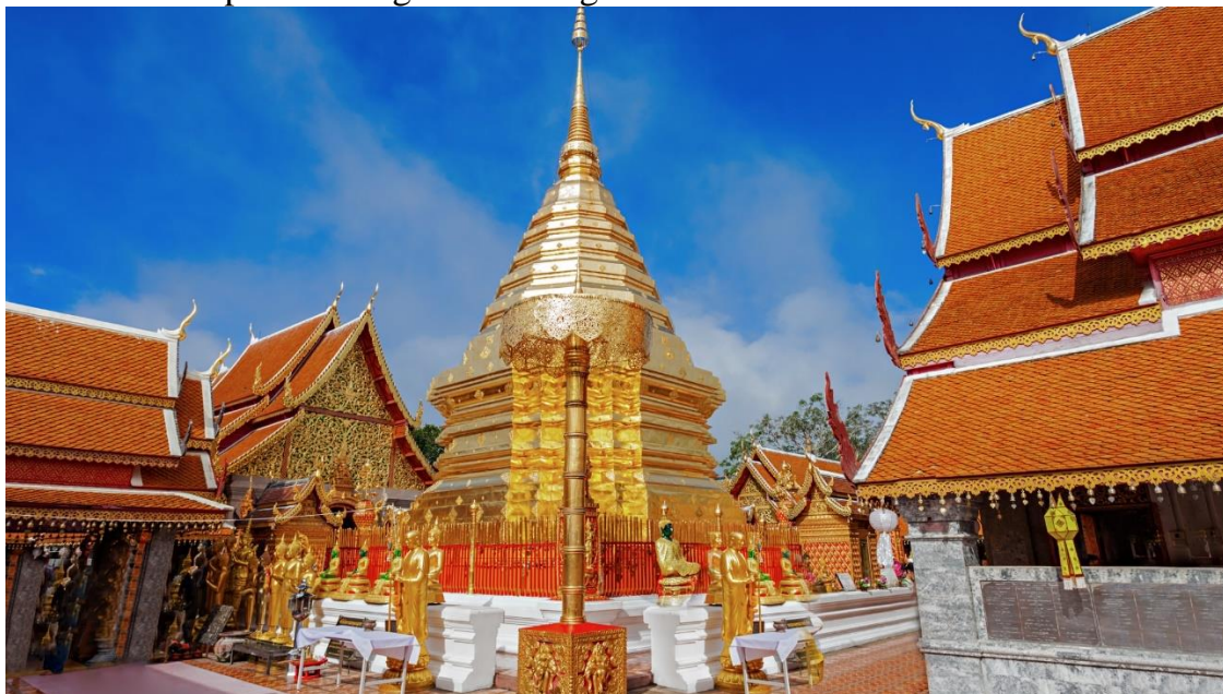
Reach Wat Phra That Doi Suthep And See Its Glittering Golden Flakes

Return to the hotel and spend the night in Chiang Mai