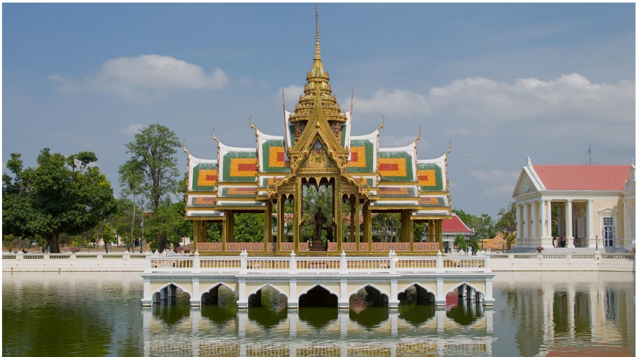
The Bang Pa In Palace With Its Mixture Of European, Gothic, And Thai Buddhist Architecture

Transfer back to Bangkok and spend the night in the city