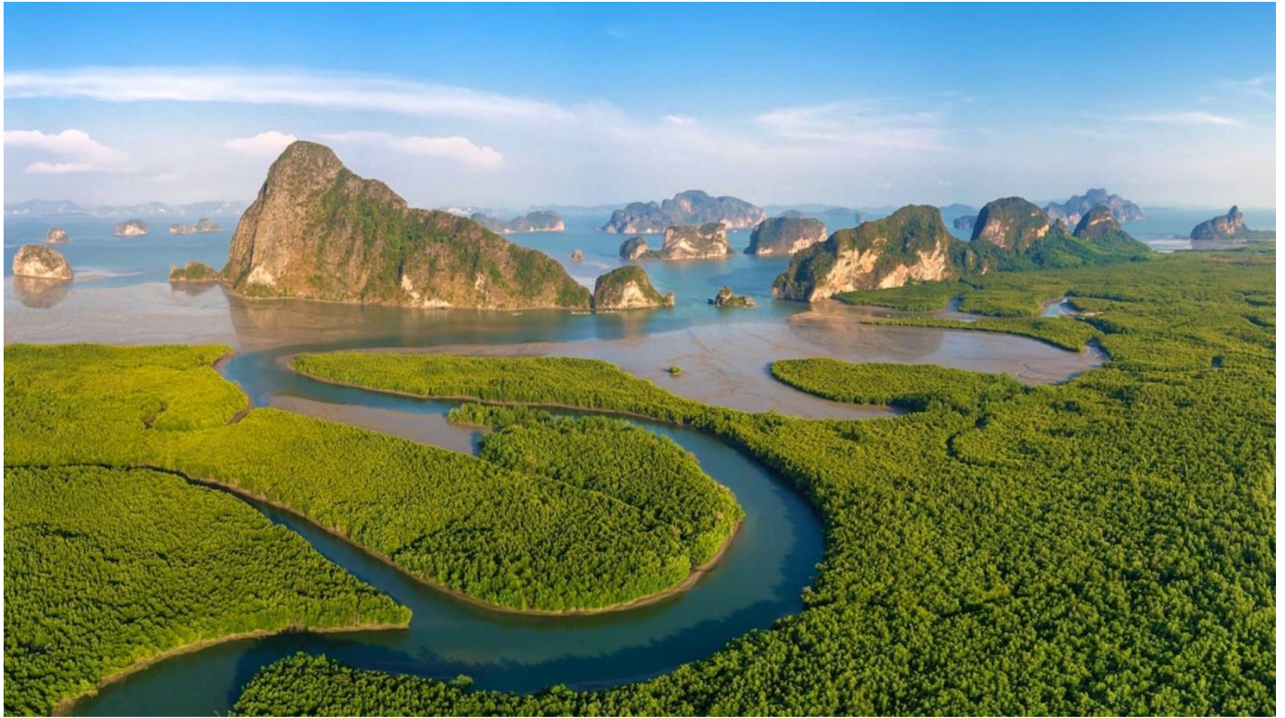
Sail Through The Stunning Scenery Of Phang Nga Bay

16.20 hrs. : Arrive to Marina and transfer back to hotel by pleasant trip.