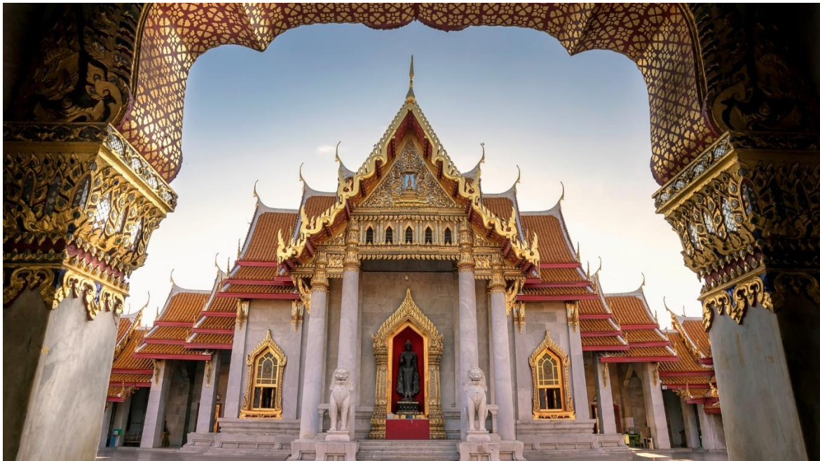
Admire The Intricate Marble Design In Wat Benchamabopit

NOTE: To show respect to the Thai culture, it is recommended that customers wear long pants, closed-toe shoes that fully cover the heel, and shirts that cover the upper arm, as well as avoid wearing vests