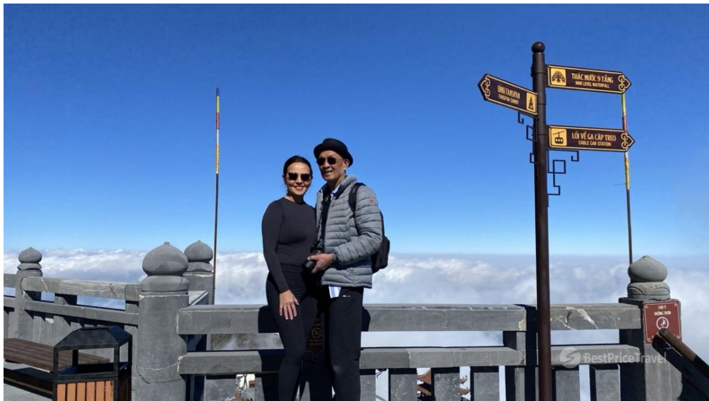
Access To The Breathtaking Fansipan Mountain