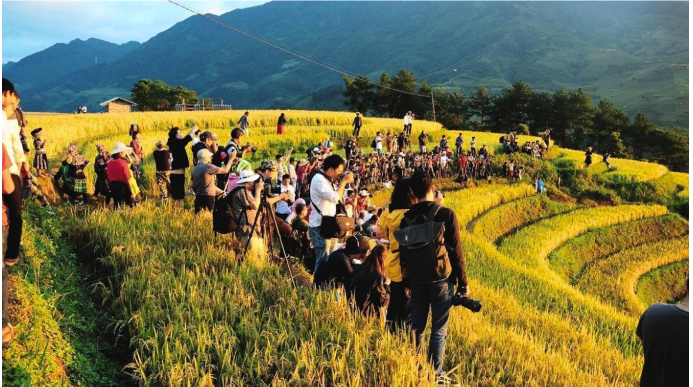
Grasp The Beauty Of Terraced Paddy Fields In Mu Cang Chai