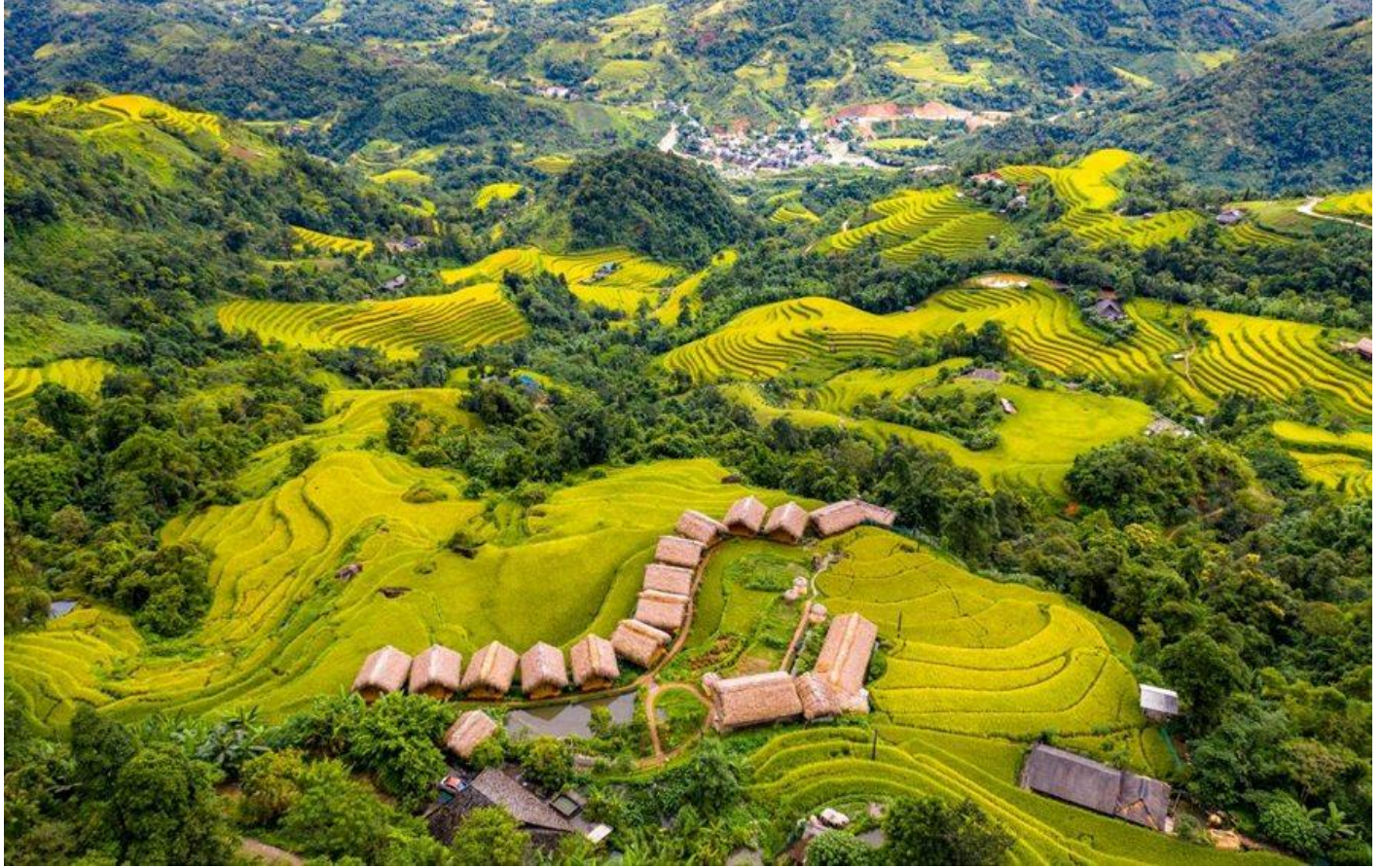
It's Great To Visit Hoang Su Phi In Rice Season