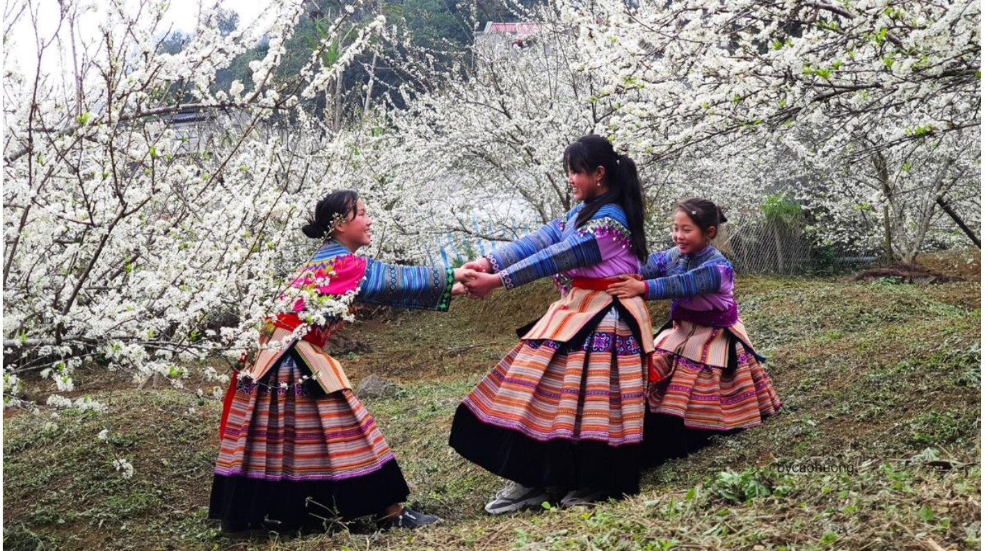
Immerse In The Bac Ha's White Forest With Tay Ethnic